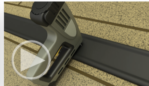
Tack with staple gun or nails, install metal roof on top