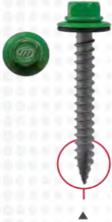
Metal2Wood XD is available in type 17 point.

Ideal for wood and light gauge metal with a pre-drilled hole. Our full range of carbon steel self-tapping screws deliver Marco quality proven in installations coast-to-coast.